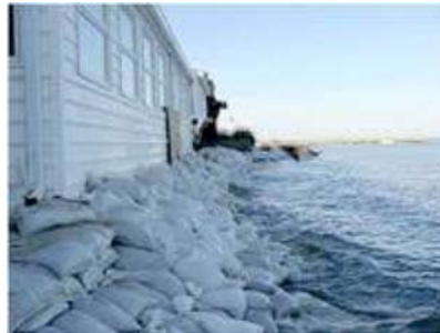
2009 flooding in Neeld Estates.

Our plan still faces review and approval by FEMA and the Maryland Emergency Management Agency (MEMA). However, residents may now use the updated flood insurance rate maps to investigate their flood risk status and determine whether to make modifications to flood insurance coverage. The maps are scheduled to become effective in December, 2011. For locations that require flood insurance, buying it now or revisiting current