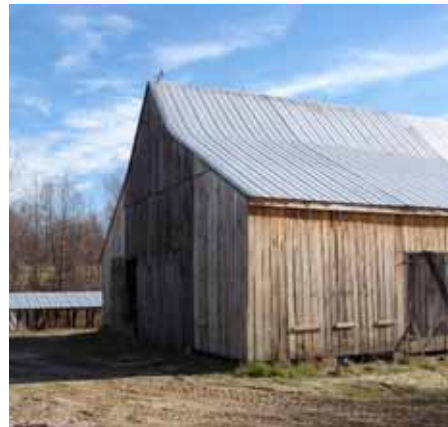
Phipps barn with recent repairs and new siding.