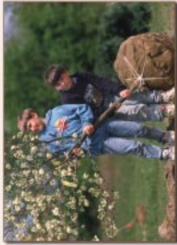
An act as simple as planting a tree can make a big difference in the health of the bay and provide vital wildlife habitat.

Presorted Standard US Postage PAID Permit No. 36 Prince Frederick MD 20678