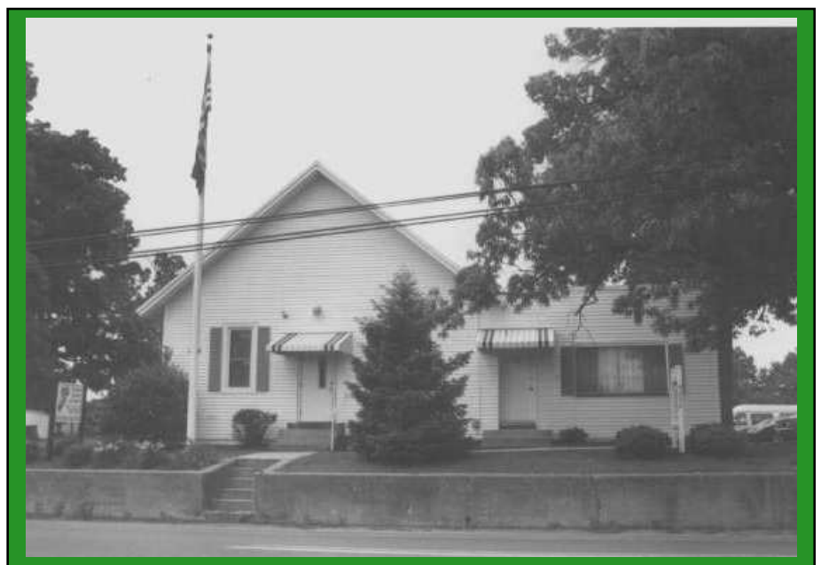
American Legion Hall, Calvert Post #85 School of Dance, CT-757

The hall was built in 1914 by the Huntingtown Improvement Company as a place for citizens "to better themselves through education and art appreciation." The building is a rare example of a community hall.