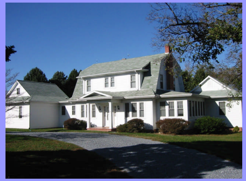
The Leitch House, built in 1932, exemplifies the Dutch Colonial Revival style. The outbuildings illustrate agricultural aspects of Huntingtown in the 1920s

THE BUILDINGS & LANDMARKS TELL THE HISTORY OF A COMMUNITY