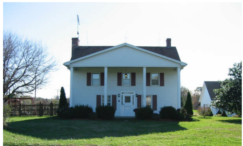
CT-404 on Huntingtown Road may have been built in the 19 th century, though it has been substantially altered.